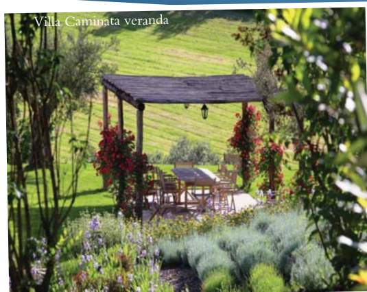
Villa Caminata veranda