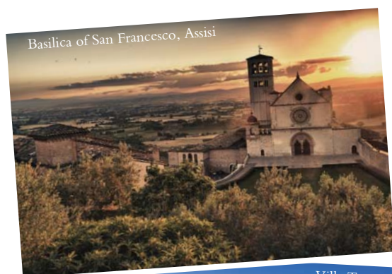
Basilica of San Francesco, Assisi