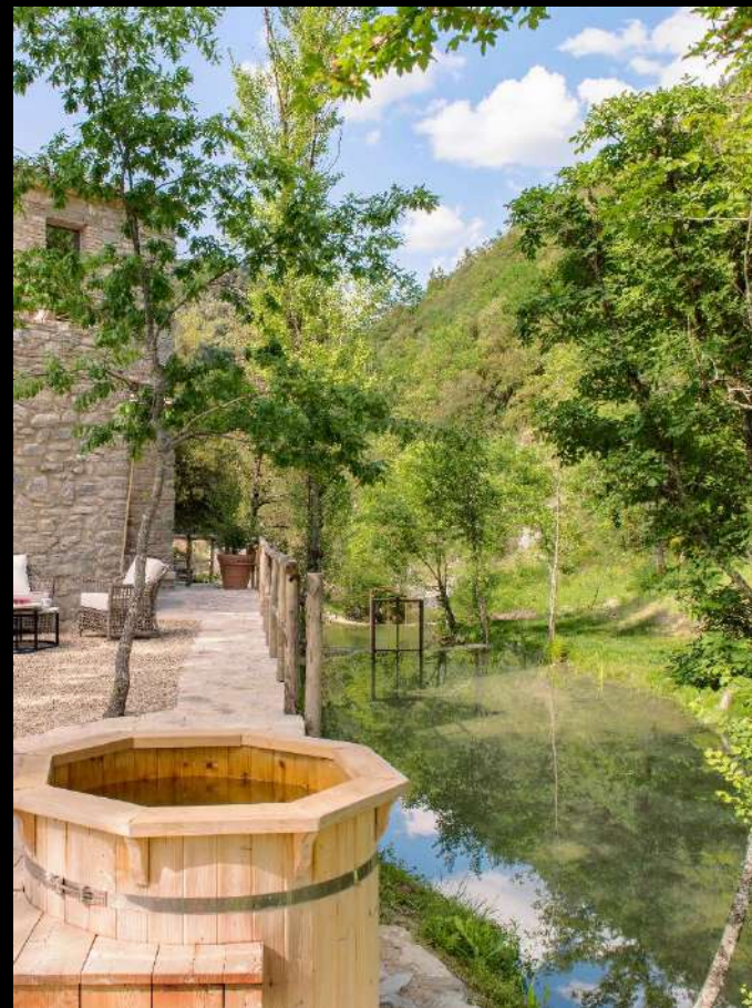
The sauna and the outdoor hot tub by the stream