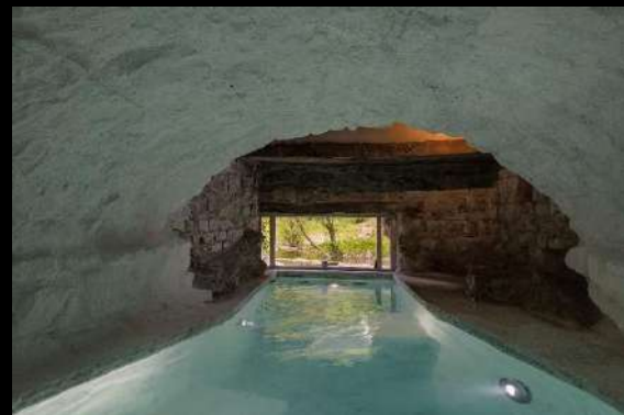
The living room with access to the underground Jacuzzi overlooking the river